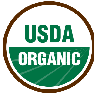
USDA Organic Logo

II.2.3. Labeling Organic Food: UAE.S GSO 2374:2014 “Guidelines for the production, processing, labeling, and marketing of organically produced foods” stipulates a product claimed as organic must include an organic logo and be accompanied by a government competent authority certificate. The United States Department of Agriculture organic logo (USDA Organic) and certificate is accepted by UAE authorities. If a product is organic but not claimed on the package, no certificate or attestation is required. Additional information can be found through the following site: https://www.moccae.gov.ae/en/legislations.aspx#page=1 .